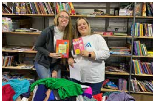
Kids to Love, Serve Day