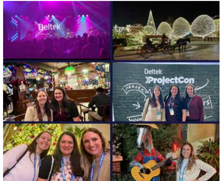
Government Contracting team training and fun

Overall, we worked with our GovCon clients through the Employee Retention Tax Credit (ERTC) process and the impacts that ERTC would have to their rates and contract billings.