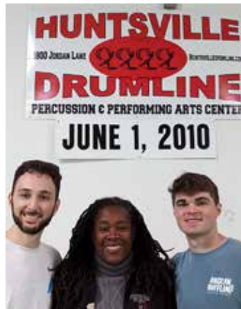
Huntsville Community Drumline, Serve Day