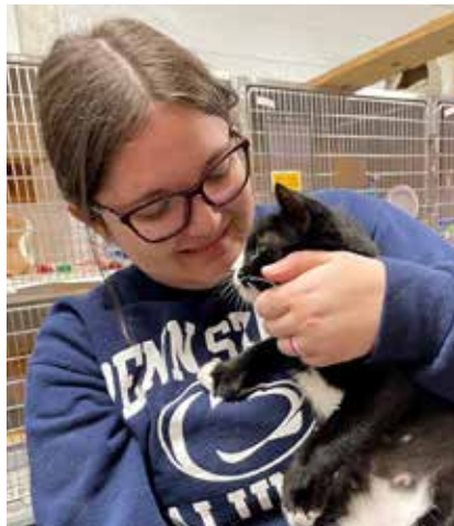
Pensacola Humane Society, Serve Day