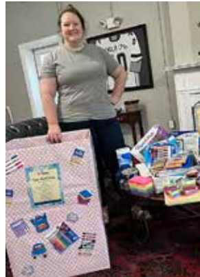
O.J. Semmes School