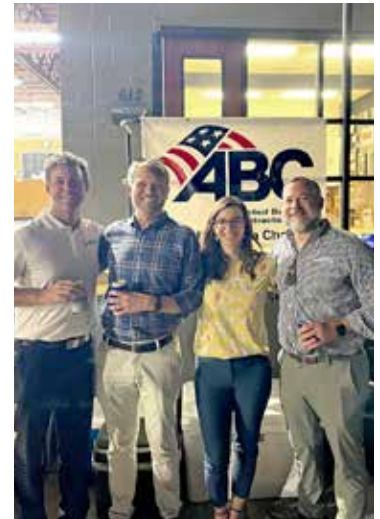
North Florida Associated Builders and Contractors Event