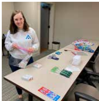
First Stop Homeless, Serve Day