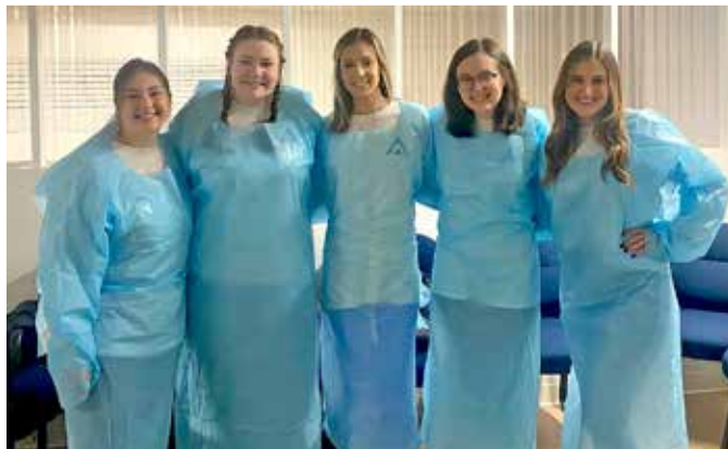
Manna House, Serve Day