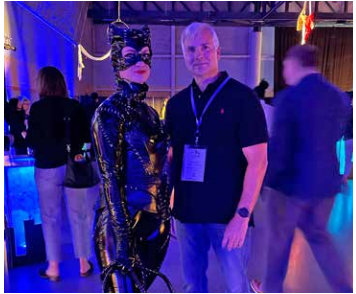
Avantax Planning Partners, Elevate 2022 Conference