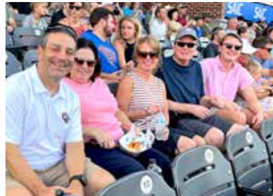
Trash Pandas Game