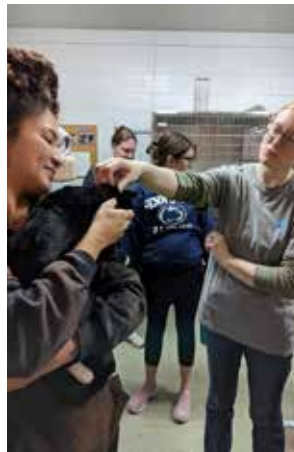
Pensacola Humane Society, Serve Day