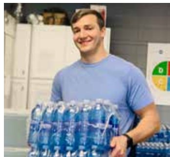
Village of Promise, Serve Day