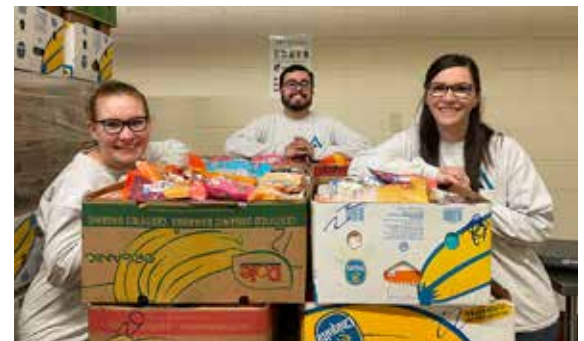
North Alabama Food Bank, Serve Day