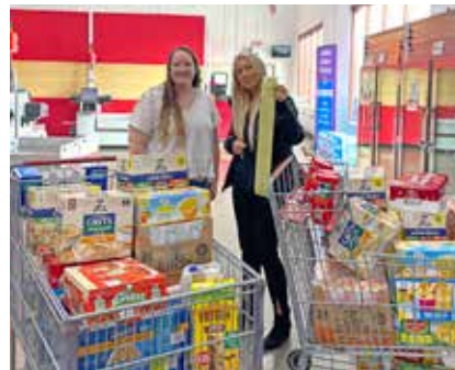
Thanksgiving Food Drive