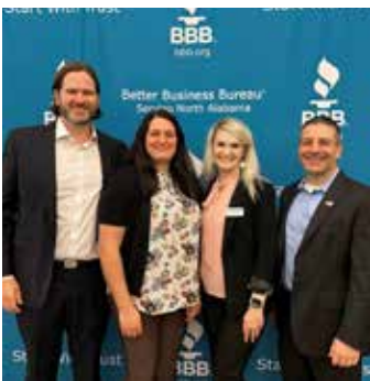
BBB Torch Awards