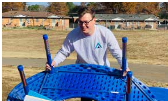
Village of Promise, Serve Day