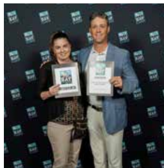
Best of the Bay Recognition