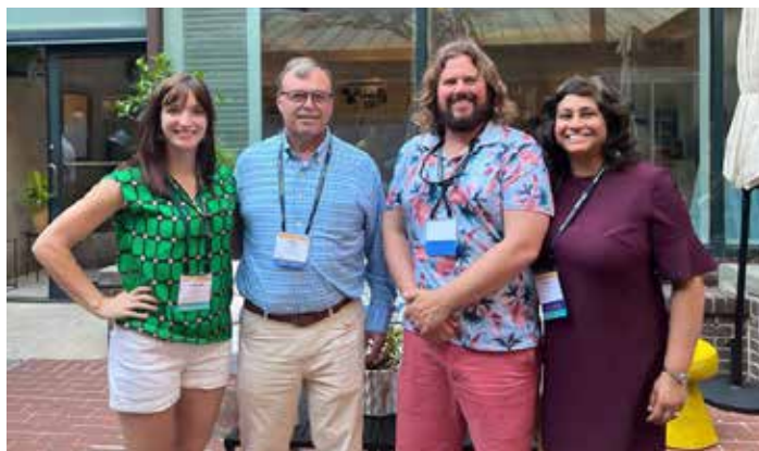
CPAmerica A&A Conference