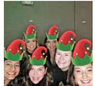
Huntsville Christmas Party