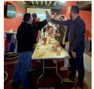
Furniture Factory Bar & Grill