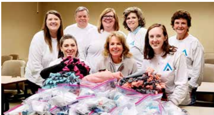
First Stop Homeless - Serve Day