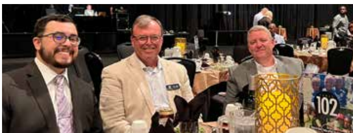
Boys & Girls Club - Leaders & Legends event

Friends, Inc. - Board Member Hampton Cove Elementary School PTA - Treasurer