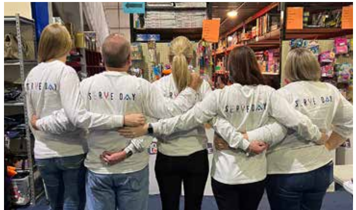
Kids to Love, Serve Day