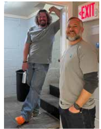
305 8th Street, Serve Day