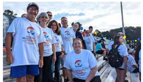
Buddy Walk at University of West Florida in support of kids with Down Syndrome.