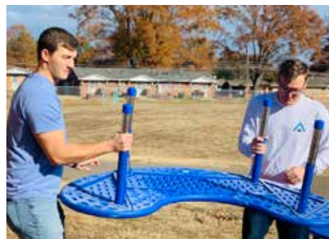
Village of Promise, Serve Day