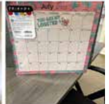
Corporate Tax Team Calendar Exchange