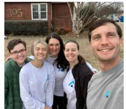
305 8th Street, Serve Day