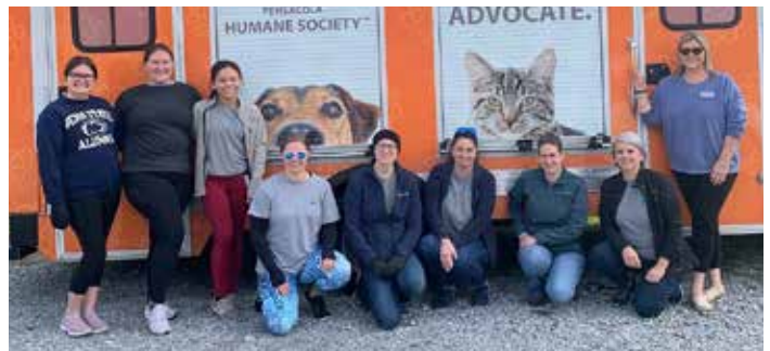
Pensacola Humane Society, Serve Day