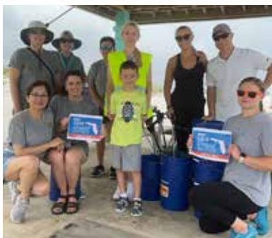
Ft Pikers, Pensacola Beach Clean-Up Day