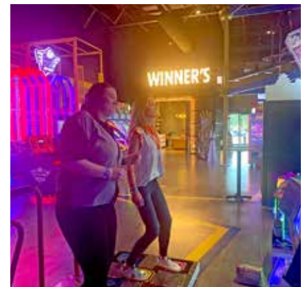
Audit Team Building at Main Event in Huntsville