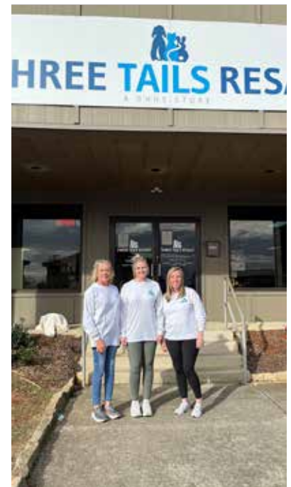
Greater Huntsville Humane Society Thrift Store, Serve Day