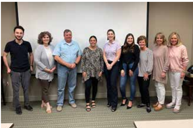
Administrative Professionals Day