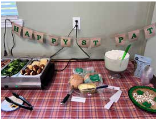
St. Patrick's Day Potluck in Pensacola