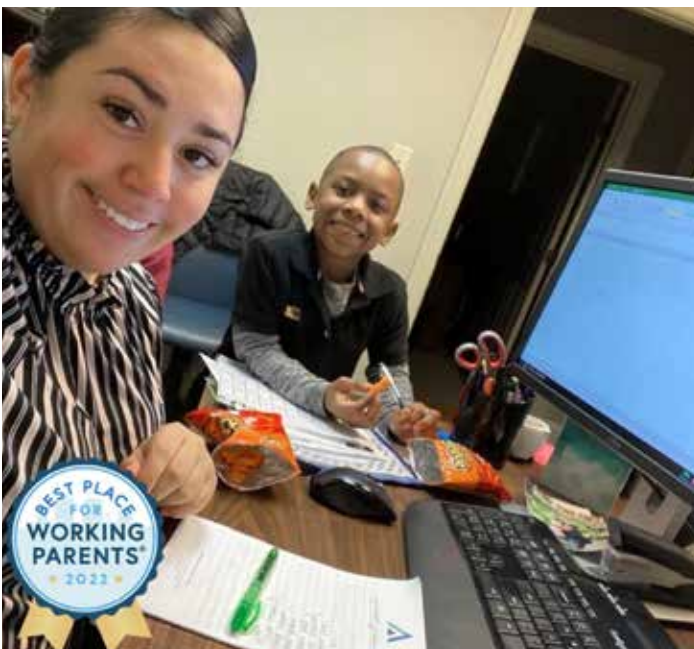
Best Place for Working Parents Award