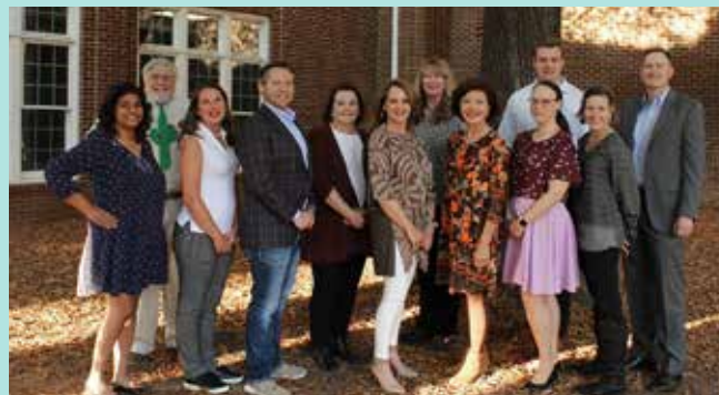
Autumn Evening, 2022 - Friends, Inc.