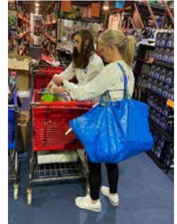
Pensacola Humane Society, Serve Day Kids to Love, Serve Day