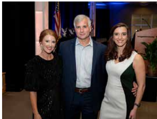
ABC of North Alabama Event