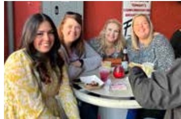
Furniture Factory Bar