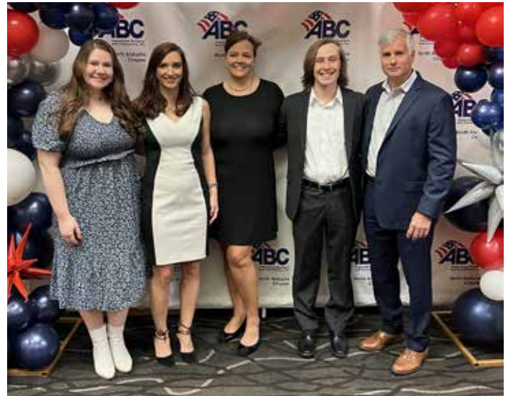
ABC of North Alabama Excellence in Construction Awards

To support our clients, the team gained extensive experience in ComputerEase software.