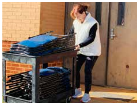
Village of Promise, Serve Day