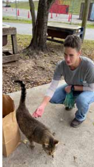
Pensacola Humane Society, Serve Day

Whether we have worked together for years or just met in the past year, we are grateful for our clients and community partners. You make us stronger as a team to deliver innovative solutions and caring relationships. Thank you to everyone for making 2022 the year to get back out there!